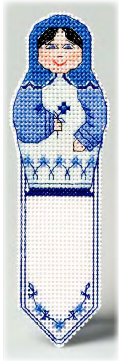
▲ Babushka Gift Label or Bookmark

If you enjoy this book, please don't copy it for your friends (which is against the law). Instead, buy your friends their own Rainbow Disks for their birthdays. Then the publishers will be able to produce more good books, and pay the authors a fair income for their very hard work.