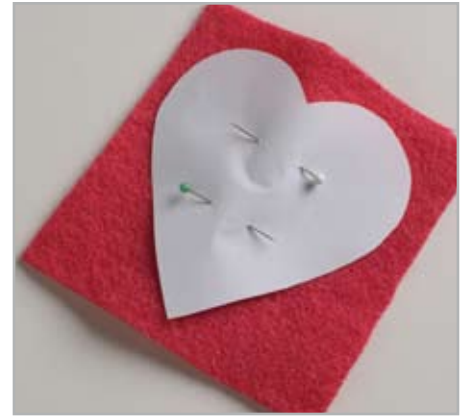
The template pinned to the fabric, ready to cut out the fabric shape