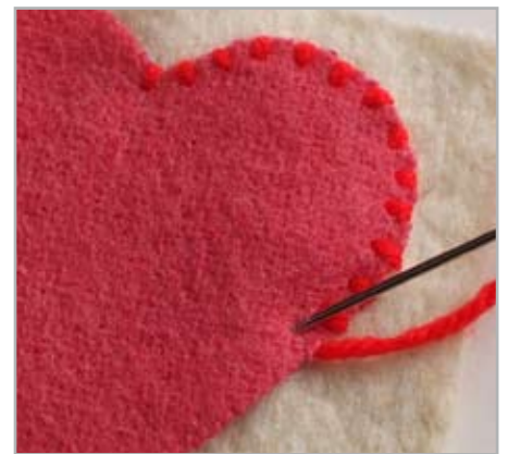
Overstitching round the edge of the fabric in thick knitting yarn (above) and perle embroidery thread (below)