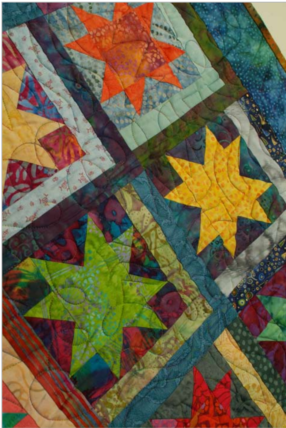
Detail of quilting and binding

14. Don't forget the label on the back of the quilt.