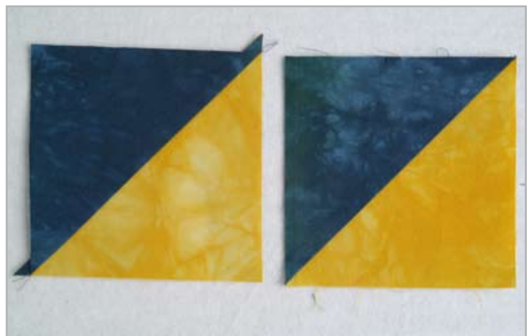
Making the half square triangle units